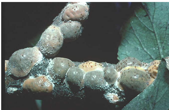
Magnolia Scale adult females and crawlers

( Magnolia stellata ), Saucer Magnolia ( Magnolia soulangeana ), Cucumbertree Magnolia ( Magnolia acuminata ) and Lily Magnolia ( Magnolia liliiflora ). It has also been reported that magnolia scale feeds on Daphne spp., Virginia Creeper ( Parthenocissus quinquefolia ), and Tuliptree ( Liriodendron tulipifera ).