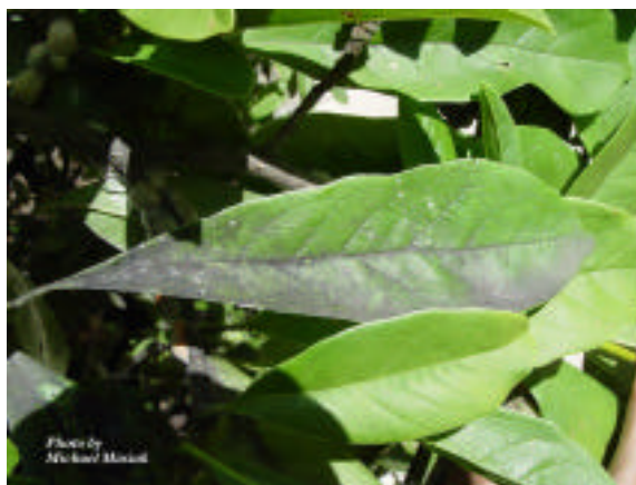
Black sooty mold growing on scale honeydew excrement